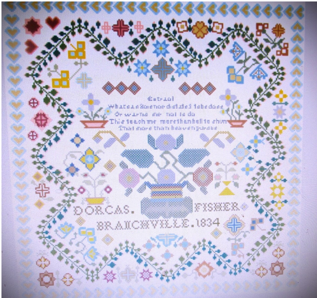
Coming soon - Dorcas Fisher Sampler