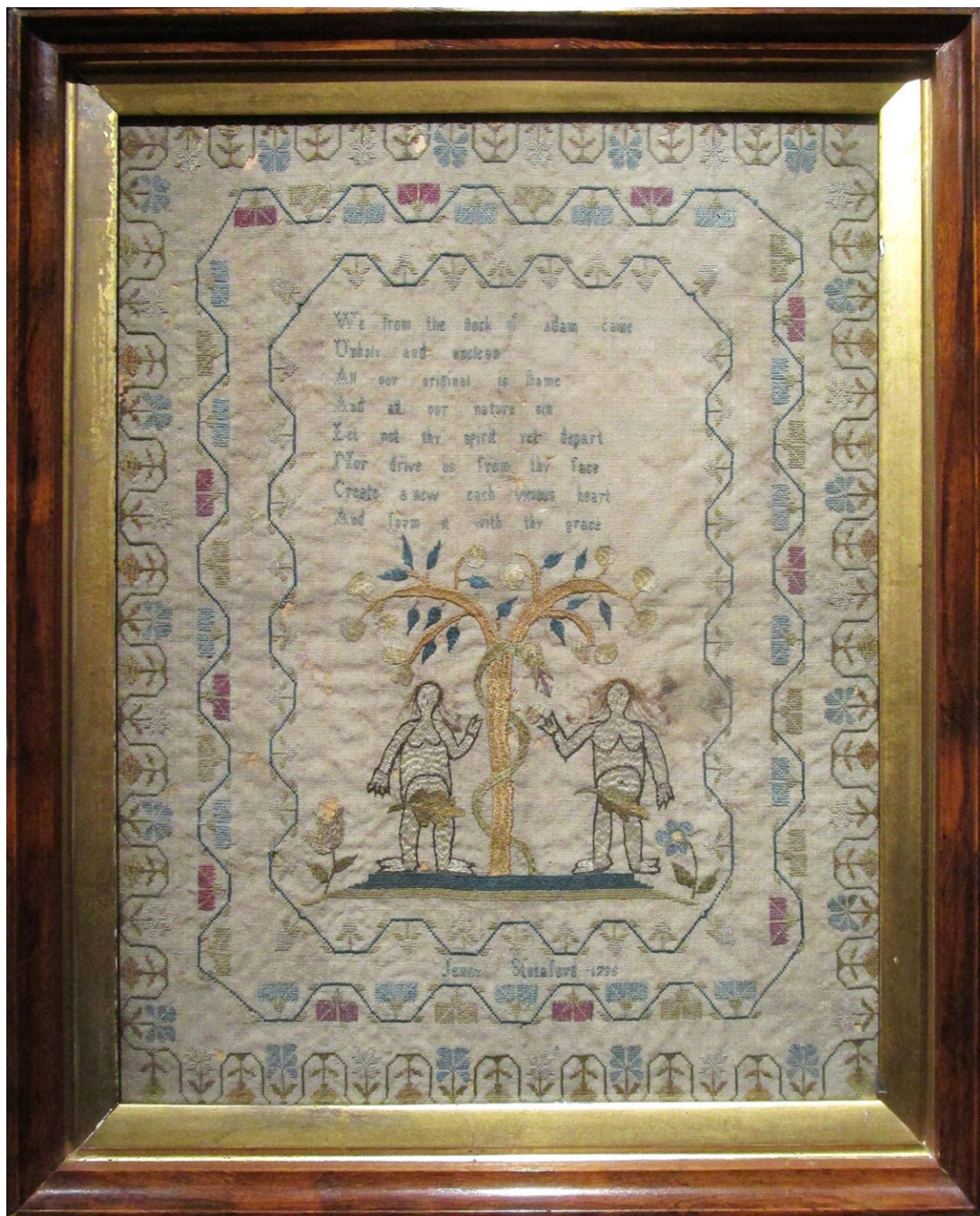
Jenny Stutaforde 1795