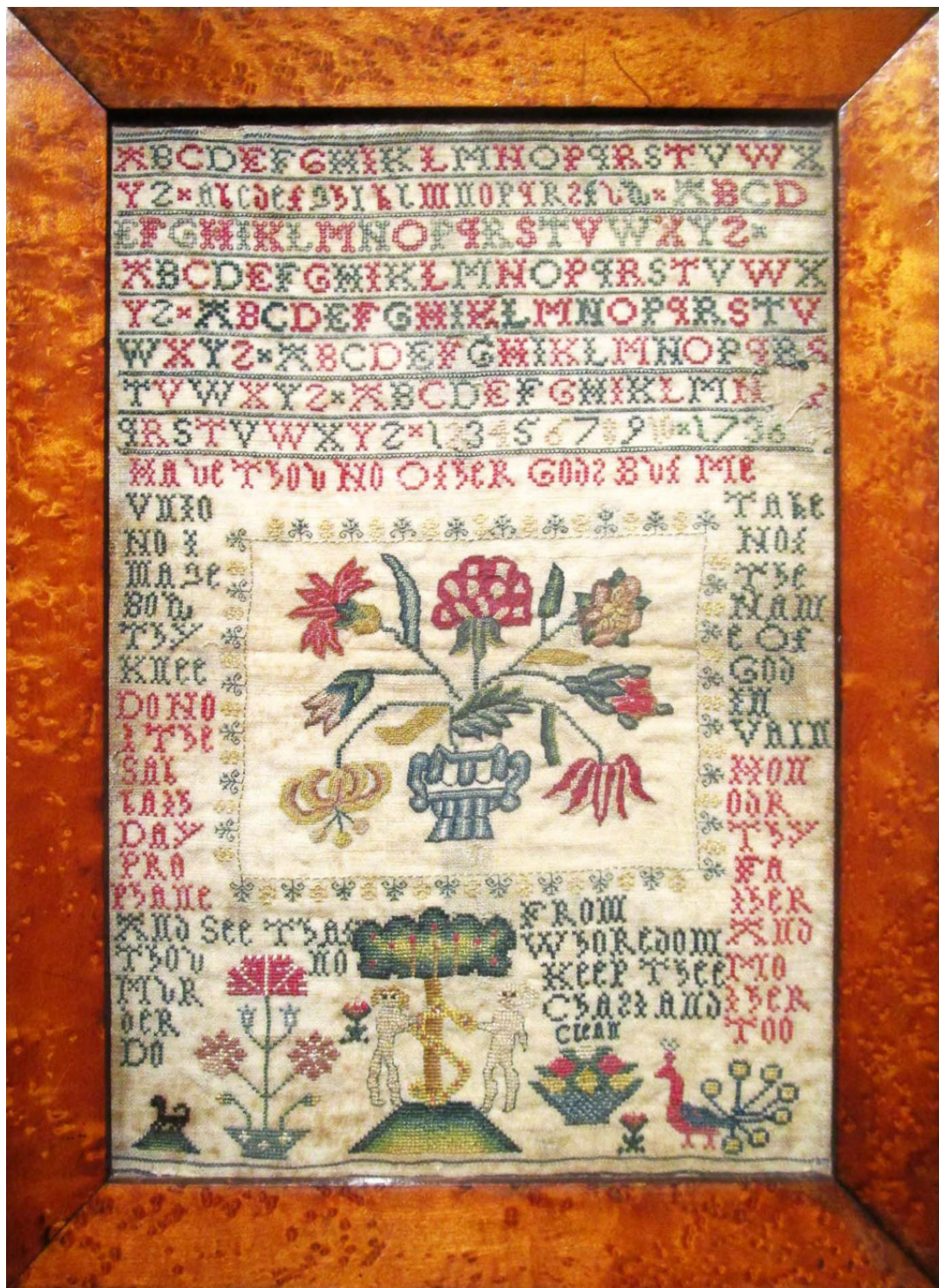
Windblown Eve 1736

Back for an encore performance, the Ackworth Quaker School sampler by Sarah Tatum has been reworked into a full color digital booklet.