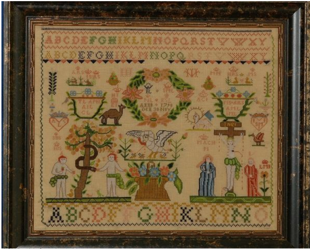
ACL Danish Sampler 1790