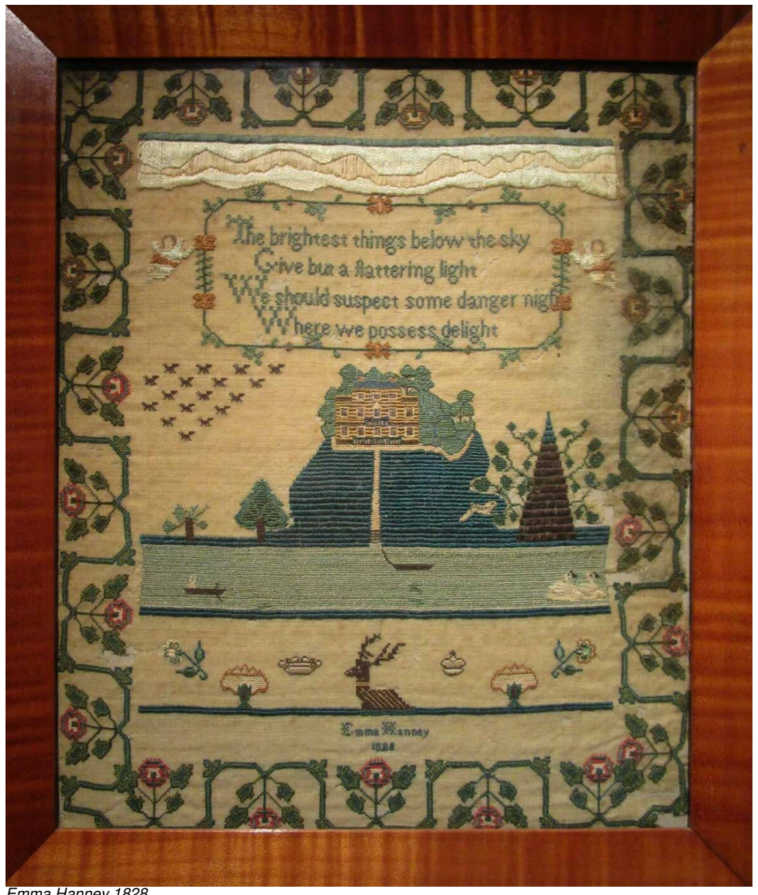
Emma Hanney 1828

The elaborate four sided border consists of complete flowers with stems. Little boats float in the lake below the hilltop house, along with two white swans.