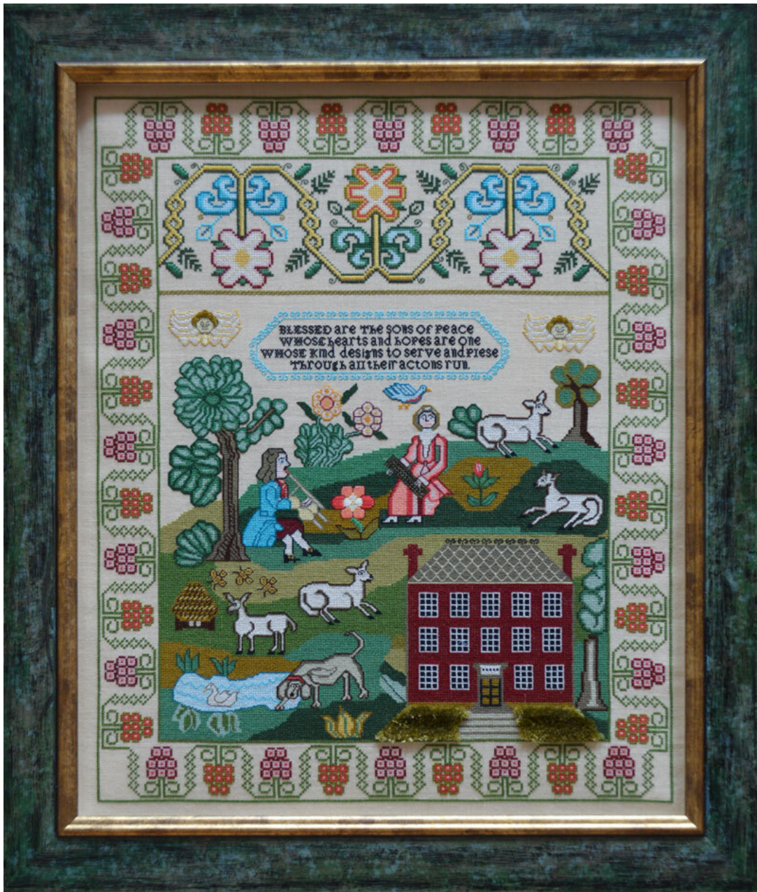
Blessed Are the Sons of Peace