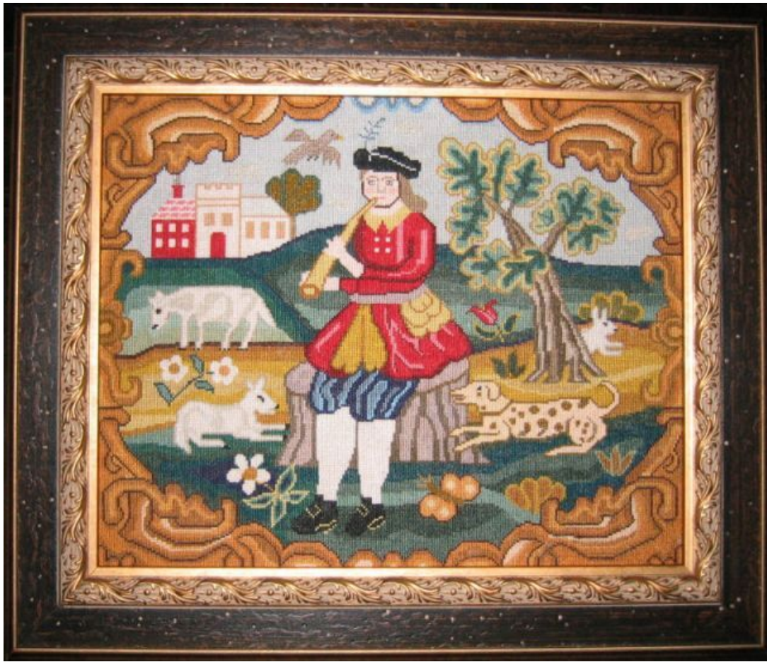
The Piping Shepherd circa 1730