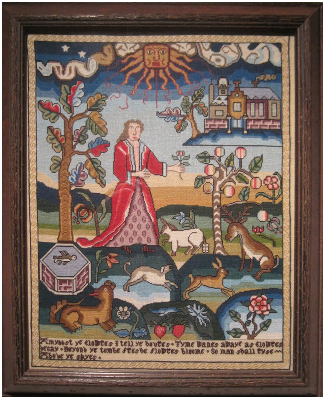
Lady and the Castle in an Autumn Landscape circa 1700