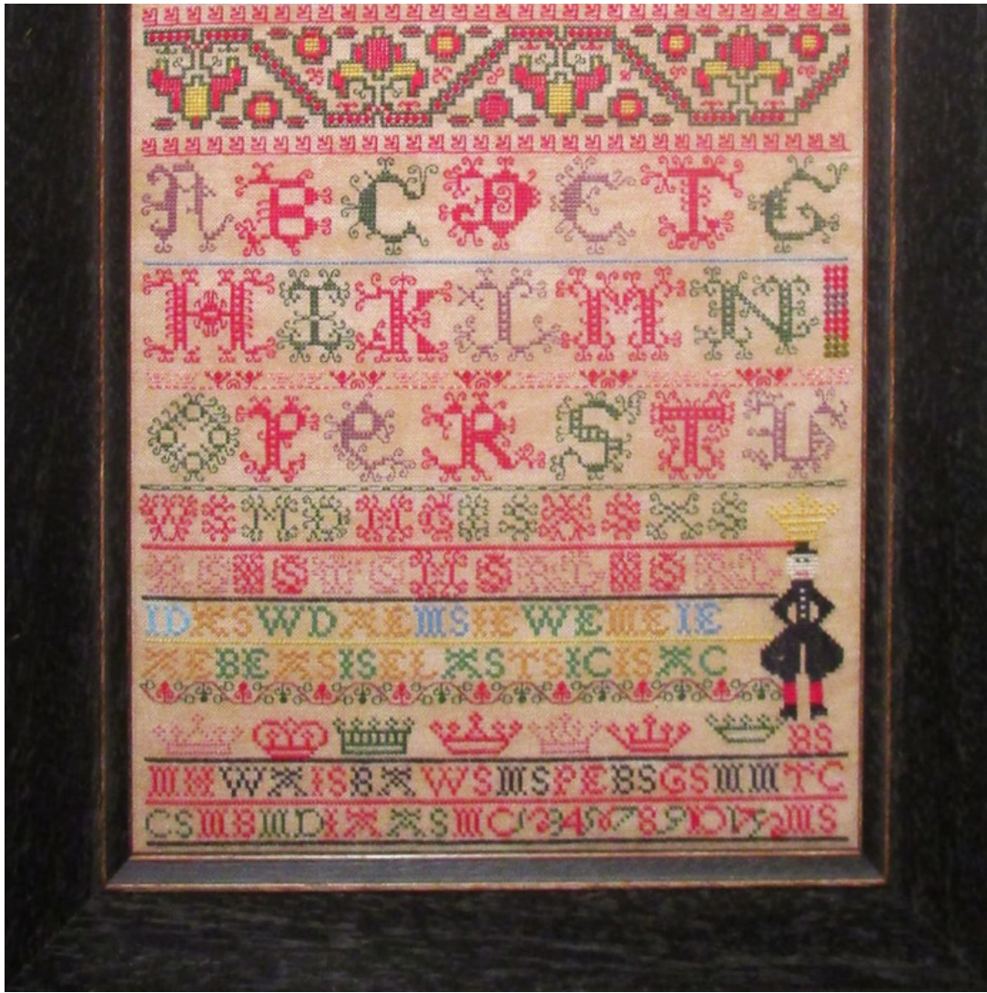
MS Dated 1752