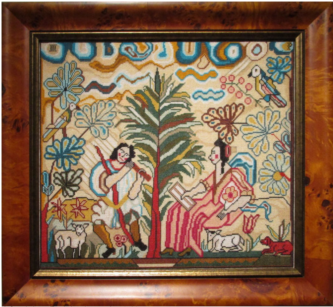
A Couple in an Exotic Landscape circa 1730