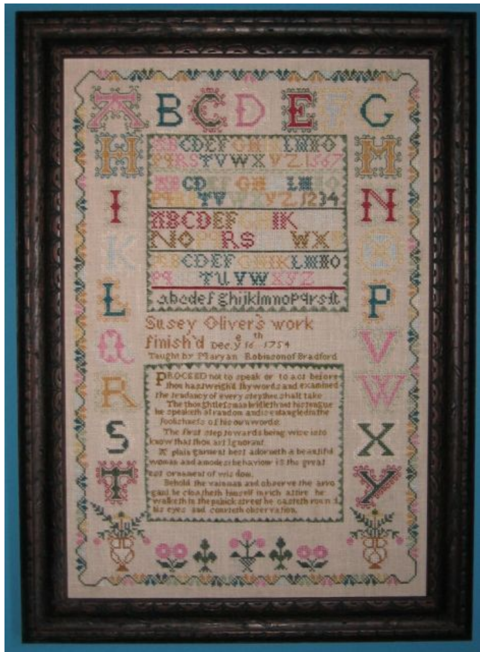
Sussey Oliver 1754