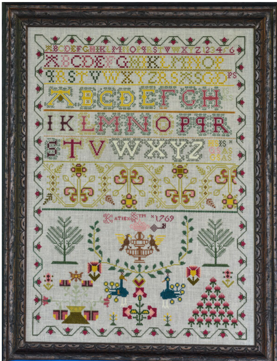
Katie Sym 1769