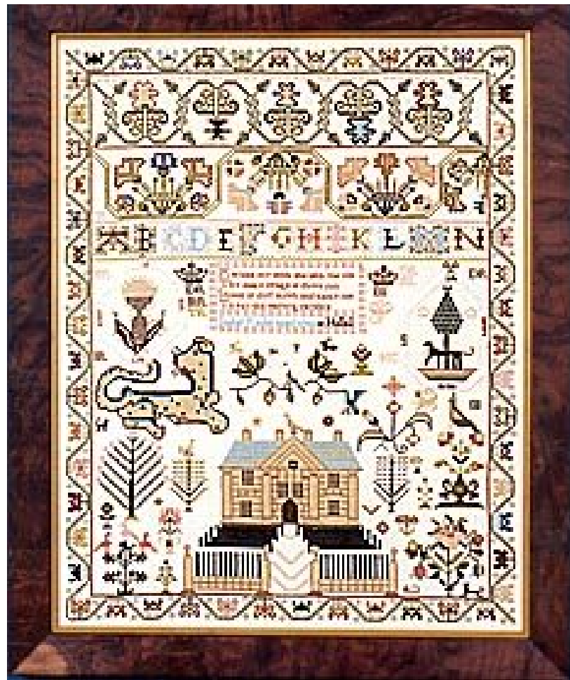
Isabel Redie 1816