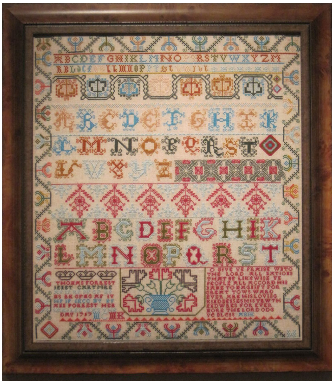
Ann Forrest 1757

Visit the website to see all of the Scottish samplers that I have reproduced. They are available as charts or as complete kits, including the graph, the linen, and all of the embroidery threads required to complete the piece.