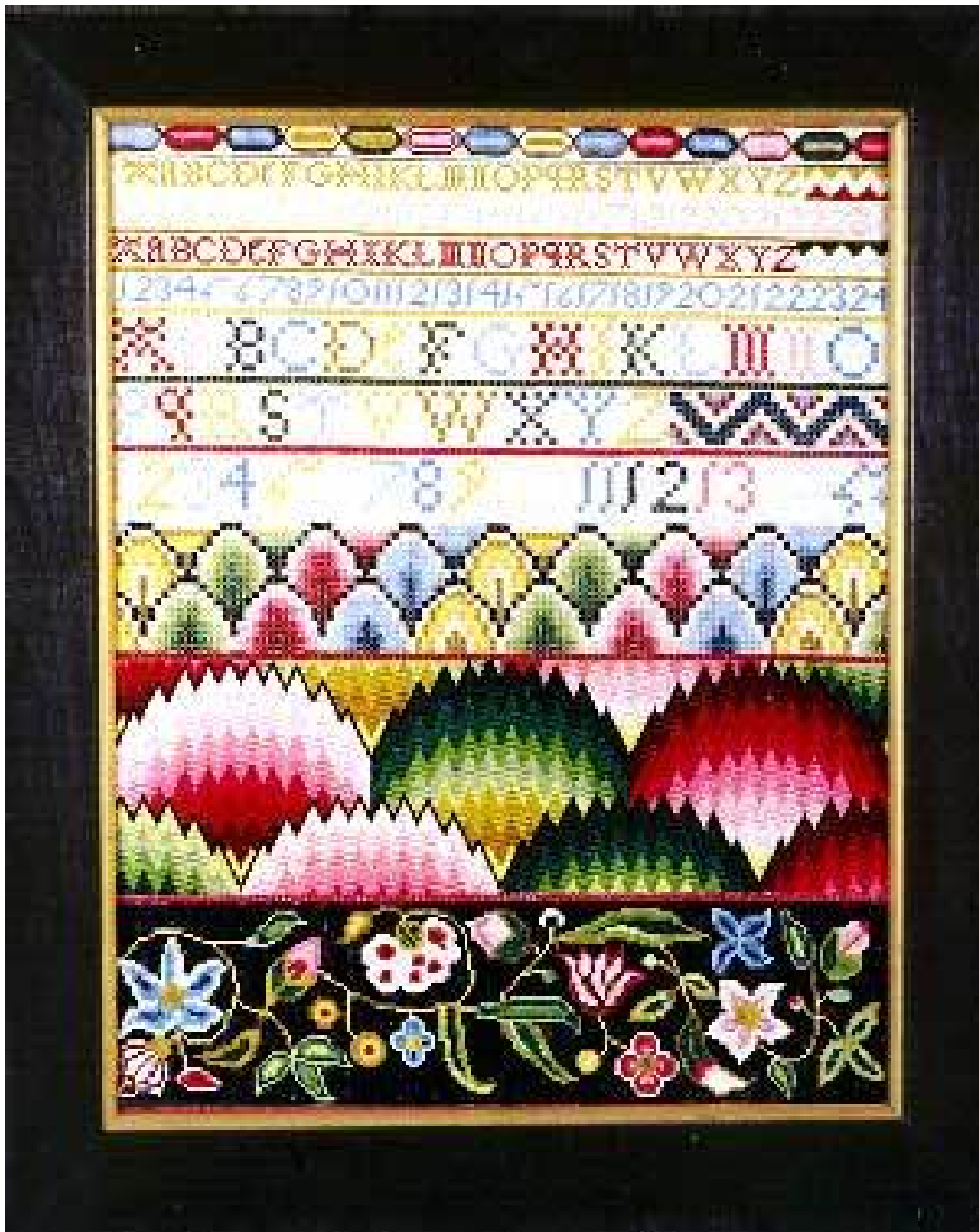
A Flamestitch Sampler circa 1760