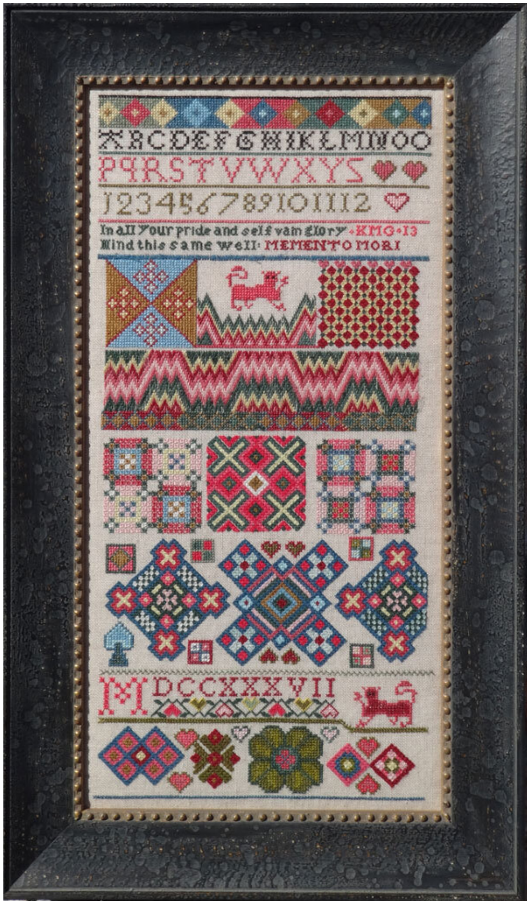
Memento Mori 1737