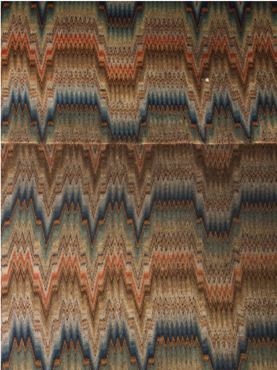
Wall Covering in Chastleton House