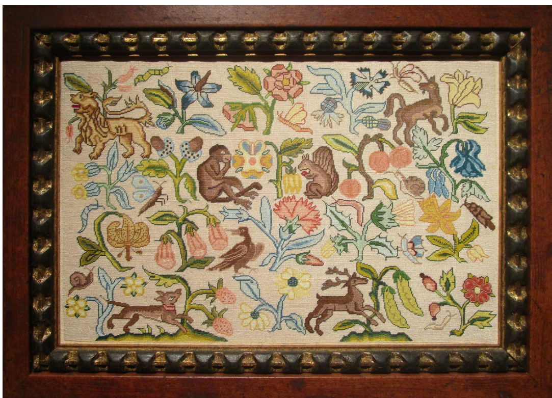
Spot Motif Embroidered Picture circa 1640