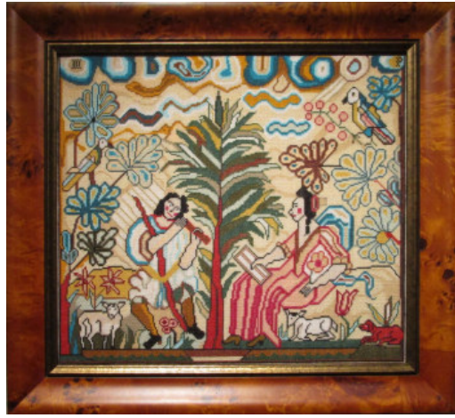
Couple in an Exotic Landscape

This is an usual early 18th century needlework picture (circa 1730). The formula is similar to other examples: a couple flanking a tree, but it is usually more like a biblical "Tree of Life" with deciduous leaves and fruit, and the couples look more traditionally western. More on Couple in an Exotic Landscape