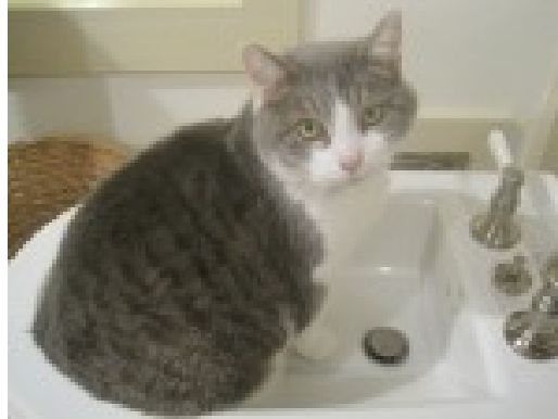
Frida on the Bidet

Harlequin, in a black mask, spends most of his time plotting mischief. More on Harlequin and Colombina