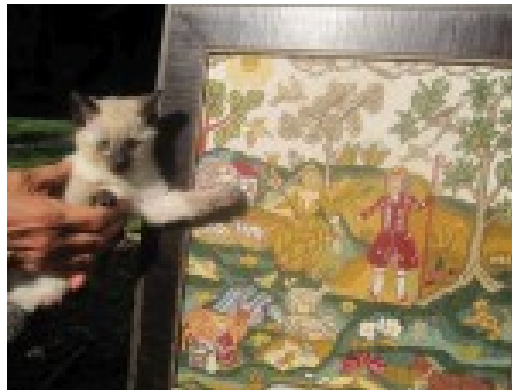
Hector Paws the Milkmaid