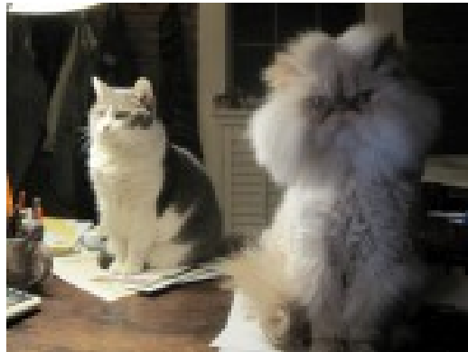
These are not mirror images.

This is an usual early 18th century needlework picture (circa 1730). The formula is similar to other examples: a couple flanking a tree, but it is usually more like a biblical "Tree of Life" with deciduous leaves and fruit, and the couples look more traditionally western. More on Couple in an Exotic Landscape