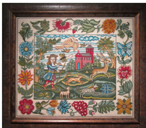
MAN, DOGS AND DEER

Flora and fauna were highly celebrated in nearly all 17th and 18th century pictorial embroideries. The two prominent themes in all of these embroideries is either biblical or the natural world. More on Man, Dogs and Deer