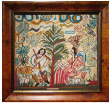
A Couple in an Exotic Landscape