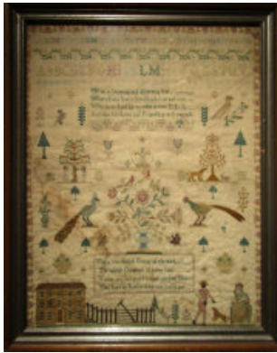
Unsigned English Sampler circa 1800