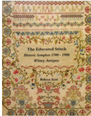
The Educated Stitch