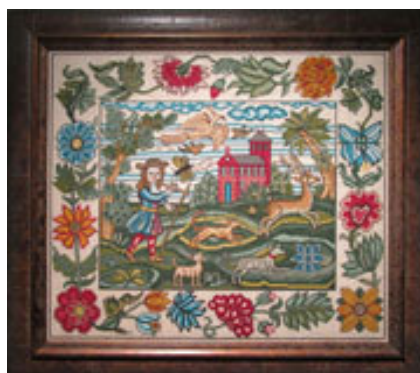
Man Dogs and Deer

Flora and fauna were highly celebrated in nearly all 17th and 18th century pictorial