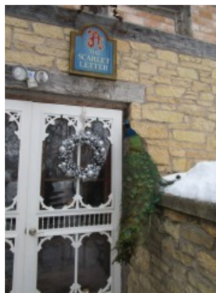
Big Noogie returns to Smoke Ham Farm