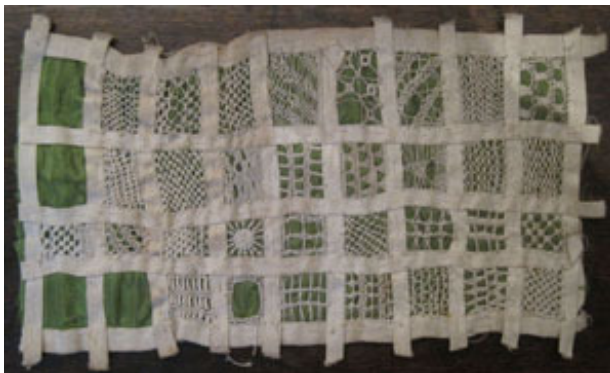
Scottish Cut and Drawn Work