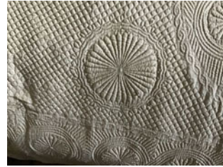
Quiz #1 photo

Please identify where this photo was taken. The first person to respond correctly with the right answer wins his/her chart of choice. Click on the photo for a larger picture.