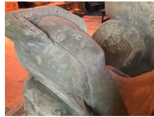
Quiz #2 Photo

Please identify where this photo was taken. The first person to respond correctly with the right answer wins his/her chart of choice. Click on the photo for a larger picture.