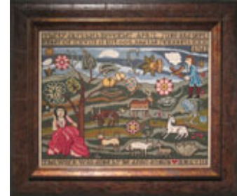
Thirty days hath November