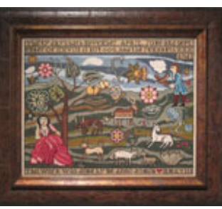
Thirty days hath November