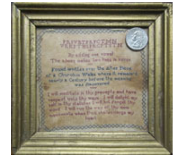
Miniature Puzzle Sampler