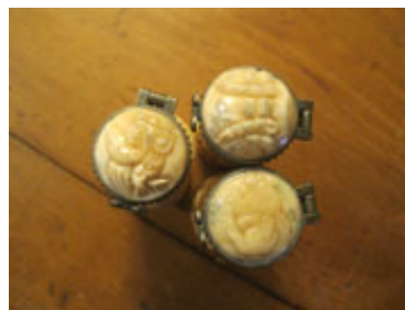
Needle Case Tops