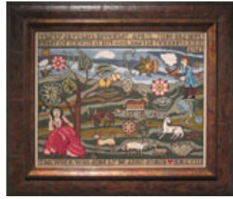
Thirty days hath November

The depiction of a lazy shepherdess intrigued me when I first saw it in a blurry old illustration of an eighteenth century New England canvaswork picture. She lounges beneath a tree looking dazed, bored, oblivious to the fantastic scene unfolding around her.