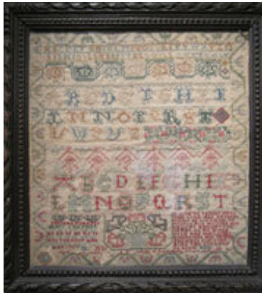
Ann Forrest 1757