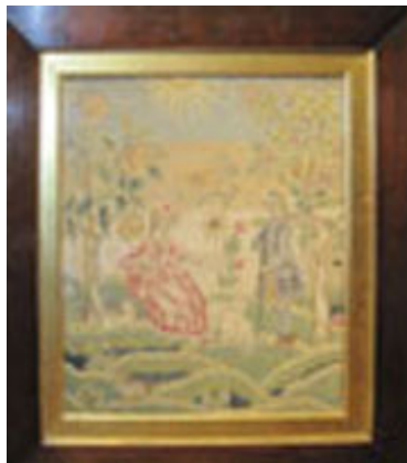
English Tent Stitch Picture