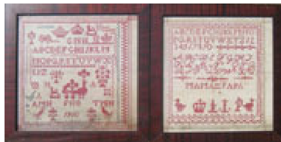
Two Dutch Schoolgirl Samplers