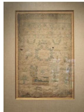
German Sampler 1802