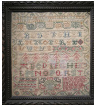
Ann Forrest 1757