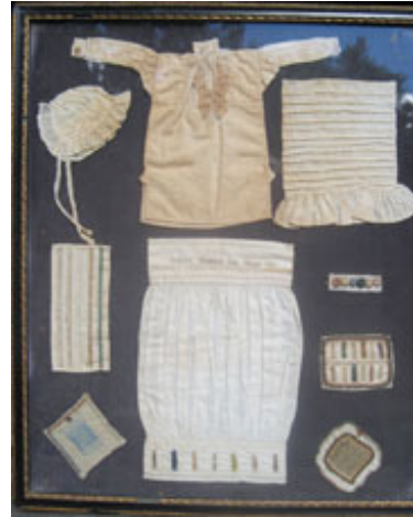
Mary Stoppard Antique Sampler

In the 19th century, one of the most important parts of the school curriculum for young girls was the mastering of sewing and darning skills, as they were expected to be able to make and repair clothing. Each school taught a slightly different skill set but they were all, basically, being able to create many different kinds of patterns darns, buttonhole stitches, needle weaving, and simple as well as more advanced techniques for clothing: smocking, ruffles and other embellishments. When the lessons were complete the examples were often bound in a small book, or mounted for display, such as is the case with Mary Stoppard's.