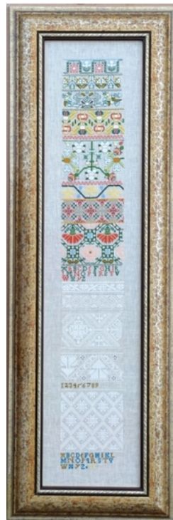
SB Reproduction Sampler