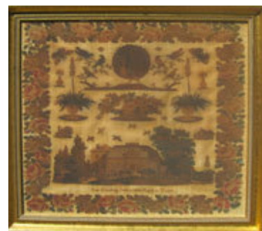
Ann Golding Antique Sampler

This sampler is in nearly perfect condition, meticulously executed in cross stitch and petit point. It features an elaborate four sided floral border of roses and violet. The upper register includes butterflies and birds, centering a magnificent peacock. Below that are potted plants centering a basket of flowers. The lower register depicts an elaborate rambling mansion house with a tiled roof, flanked by towering trees, small cottages, and flying birds. The sprawling lawn in front of the house contains a lion on a pedestal, topiary, and other plants and animals.