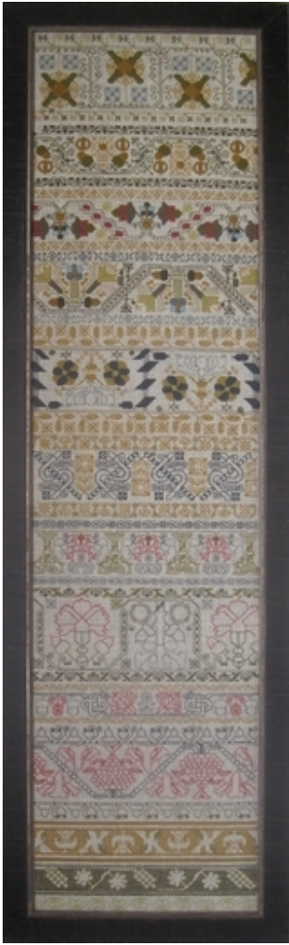
Early 17th Century English Pattern Band Sampler

This unsigned, undated band sampler from the collection of Nicola Parkman was sewed circa 1630, and captures qualities I particularly associate with the earliest English band sampler: prudence and frugality. I assume this to be an "exemplar" to emulate one's life and work. I like to imagine that the thoughts of the women of the time, most of whom embroidered for their homes rather than for whimsy or professionally, are captured in these intensely stitched horizontal bands of stitches. Later, the more practical "marked" goods (bed linens, night shirts, table linens) they recorded and chose to embellish with these patterns were much admired in clothing and other household articles.