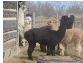
Fleece buyers wanted!

The songbirds and sand hill cranes have returned and the spring flowers are blooming after a mild winter here in Wisconsin. I've been busy designing many new samplers, even more than are shown here so please remember to check back in a few weeks for more treats.