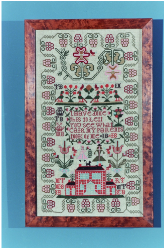
Scottish Sampler featuring a Red Mansion House