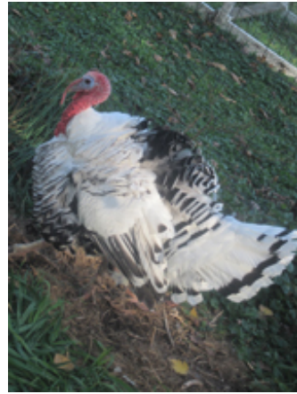
Hansel celebrates another Thanksgiving

Sales of antiques have been very soft for the past year, including samplers. Now is the time to buy because prices are very low. I am offering these four antique samplers at the price that I paid. I considered reproducing them, but decided otherwise.