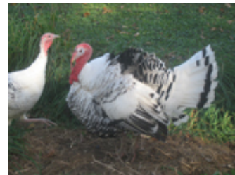
Hansel and one of his brides

There are only a few trees left with bright autumn colors here on the farm. The shed is filled with oak, maple and hickory firewood, the gardens have been put to sleep. My old tom turkey, Hansel, is about to survive his twelfth Thanksgiving along with his three brides .