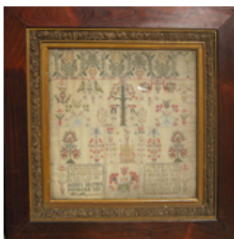
Agnes Brown-Kinghorn Antique Sampler