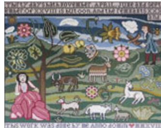
Thirty days hath November