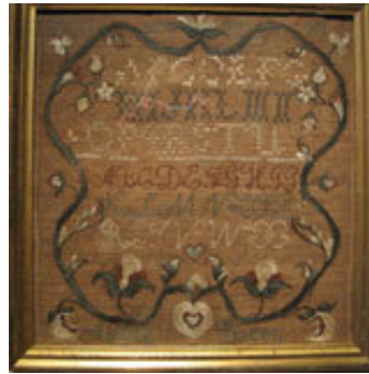
Abigail Bacon Antique