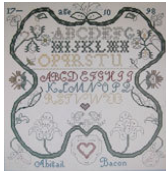
Abigail Bacon Reproduction