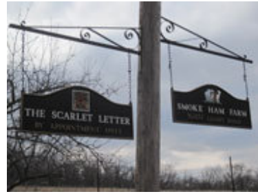
Smoke Ham Farm - The Scarlet Letter

The deadline to submit your guess is Sunday, April 15th at 6:00 PM central daylight time. The best answer wins their choice of any graph from The Scarlet Letter's collection. The solution will be posted on the puzzles page after the deadline. Send your answers to samplers@scarlet-letter.com