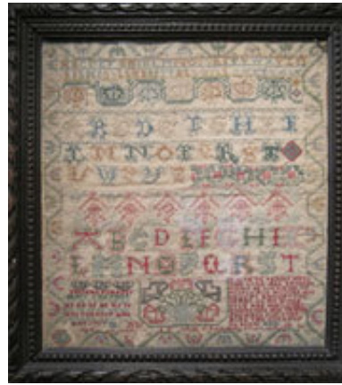
Ann Forrest 1757