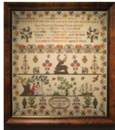
Grace Kemish now available