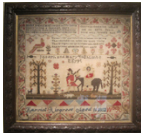
Harriot Ringrose will be available as a chart/kit early in 2018