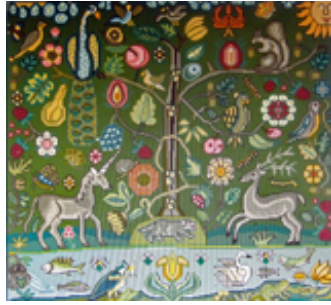
Peacock and Unicorn