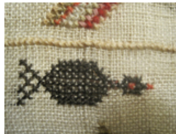
Harriot Ringrose bird