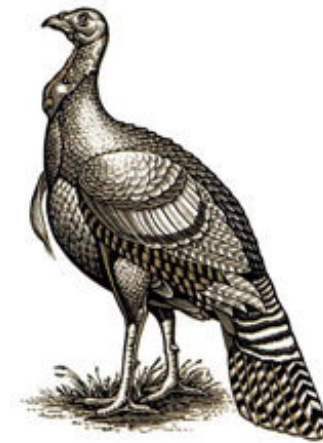
Hunt for this turkey drawing in the Samplers section

This month's quiz is not identifying flora or fauna, for a change. Instead, whoever is first to find the turkey hidden within a description of one of the samplers on my website and send an email to me with the name of the sampler will win his/her choice of any one of The Scarlet Letter's charts. As a bonus, if you click on the hiding turkey, you will find a large turkey charted from a mid nineteenth century American sampler so even if you're not the first to find it, you will be able to download the graph. Check the Newsletters Puzzles page to see if the turkey has been found.