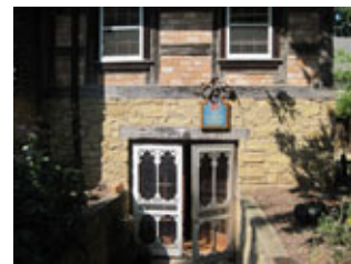
Entrance to the Scarlet Letter shop