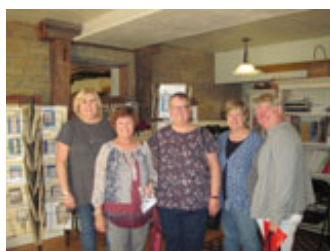
Some charts, linen scrap bags, floss and kits are on sale!