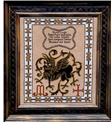
The Black Gryphon

It has been a long time since I took a holiday, and the time is approaching. I will be in Italy from the 19th of September until early October, seeking out more unusual antique embroideries such as THE BLACK GRYPHON which I found at an antiques market in Arezzo. As most customers know I ship pronto, but orders placed between September 18th and October 4th will not be processed or shipped until after October 5th. You should be able to reach me by email during that time, unless I am catatonic from eating too much fresh pasta and gelato. I appreciate your understanding.