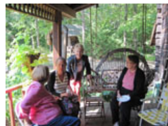
Enjoying lunch on the porch