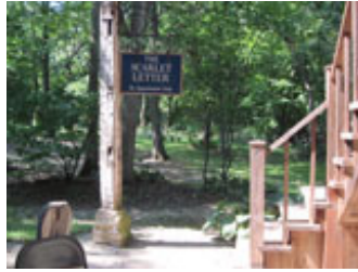
Entrance to the gallery