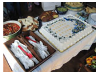
The sampler cake, Wisconsin cheeses, and some fresh veggies from my garden were some of the treats available.