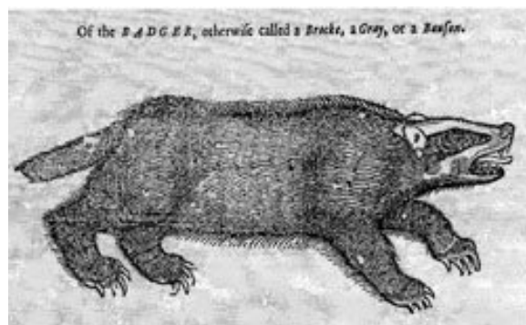
A peacock and a badger will be featured on a new design, available later this year.