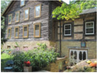
The 1892 farmhouse - home of the Scarlet Letter