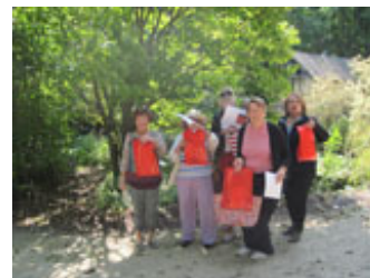
A group of Scarlet Letter shoppers