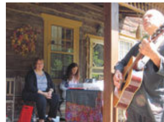
Enjoying lunch and music on the porch