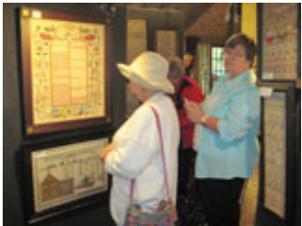
Looking at samplers in the gallery

Click on any photo to view a larger image.