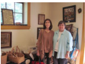
Lots of items to look at in the shop