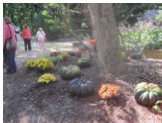
Beautiful mums and the mystery vegetable