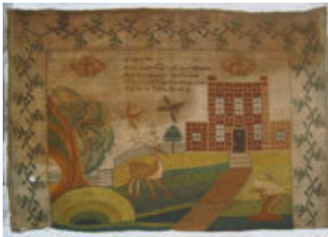
Unsigned Pictorial Sampler