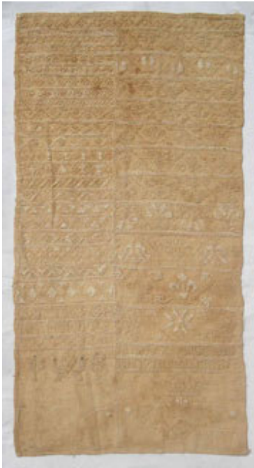
Whitework Band Sampler