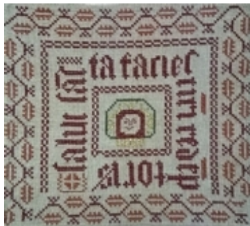
Palla Chalice Cover

This small textile originally made in the late 15th or early 16th century, is called a "palla" (chalice cover), stitched on a linen ground. The center show the face of Christ with a golden halo, framed by a narrow guilloche band and a large Latin inscription in Gothic lettering which translates as "Hail the holy face INRI the Redeemer." More about Palla.