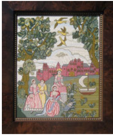
Moses in the Bulrushes

This beautiful depiction of the Old Testament story of Moses was likely made in the late seventeenth or very early eighteenth century. The lively mix of biblical story has been interpreted by the needle worker through her contemporary lens (note the rambling red brick late Tudor/early Stuart buildings and the fashionable clothing of the women-apart from their rather clumsy sandals) as they gather the baby from the river.