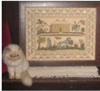
Beppo poses beside the Tiger sampler