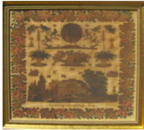
Ann Golding Antique Sampler