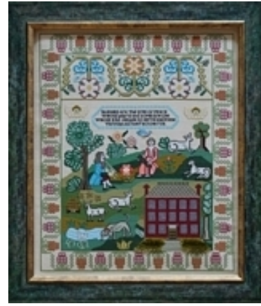
Blessed are the Sons of Peace