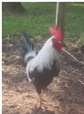
My Silver Gray Dorking rooster, an ancient breed known even to the ancient Romans